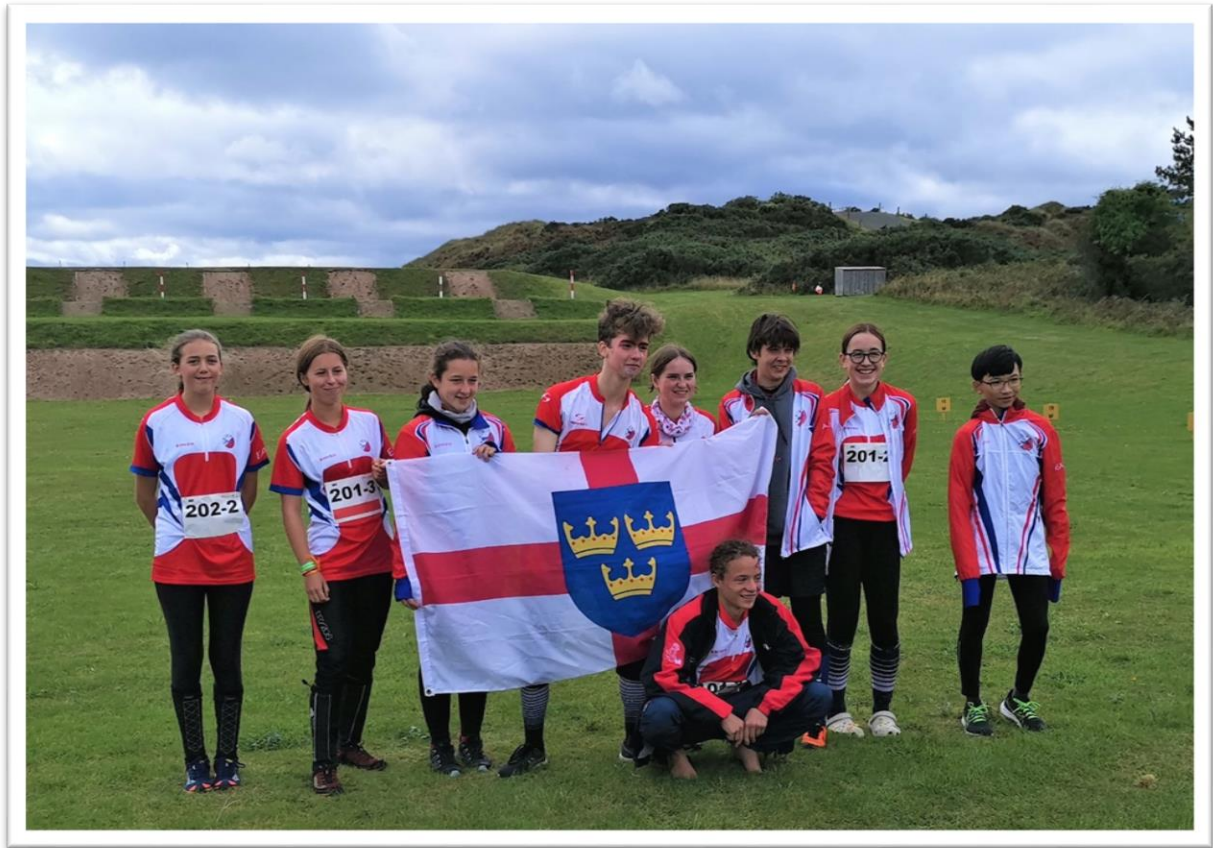
Pride of the East Anglia!