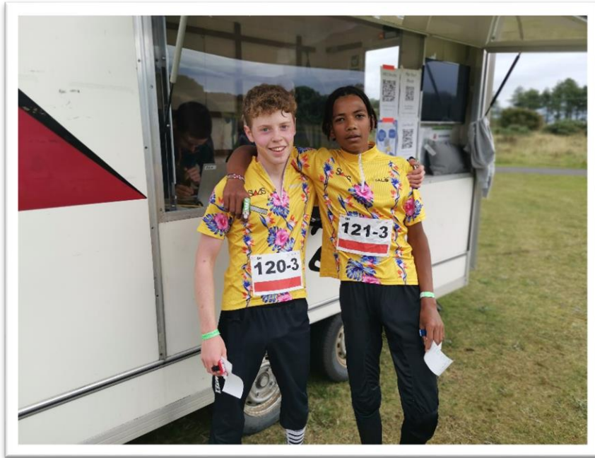
Southwest lads download relief.