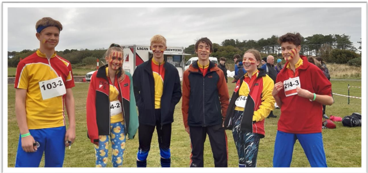
Some of the Northeast squad enjoying the post-race craic.