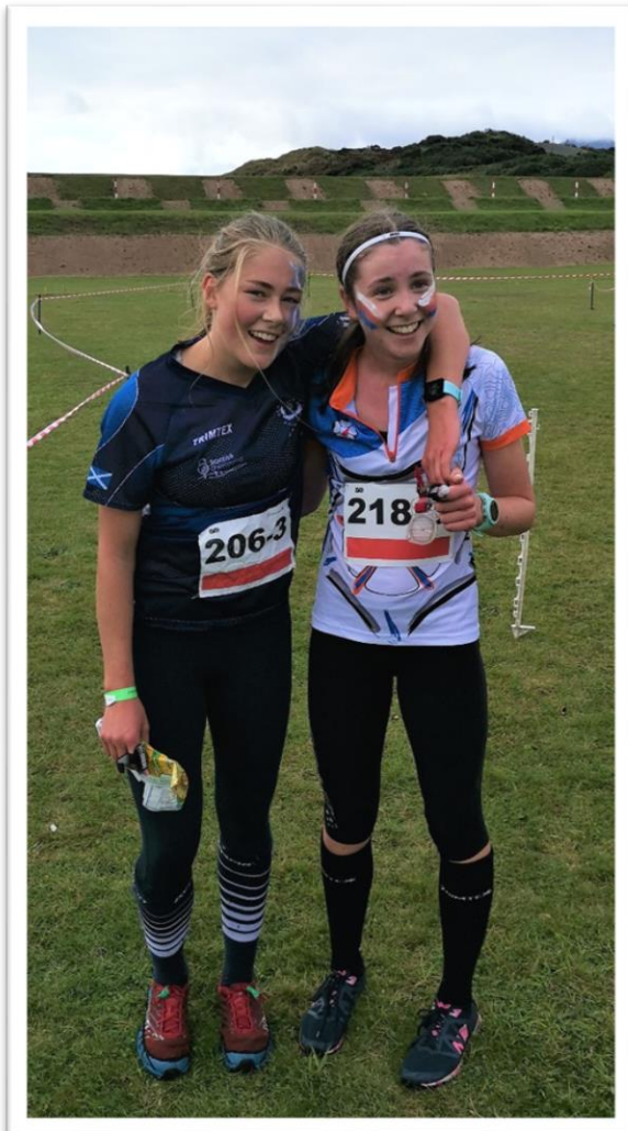
Gracious in victory and defeat!