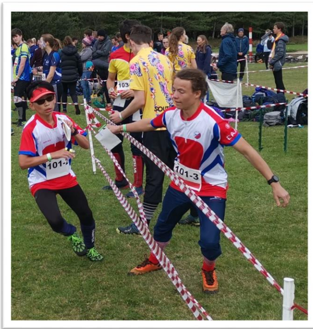
East Anglia East Midlands relay teams in full flight!