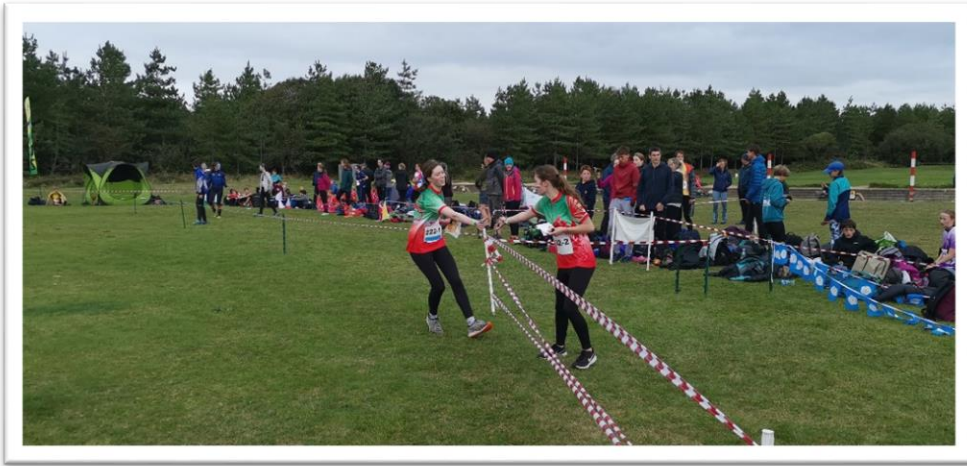
Welsh change of guard